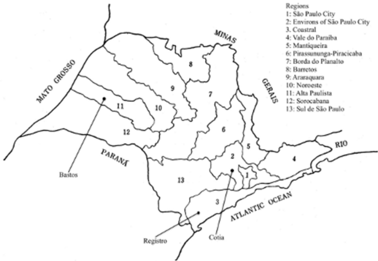
Map: Map of São Paulo and its subregions